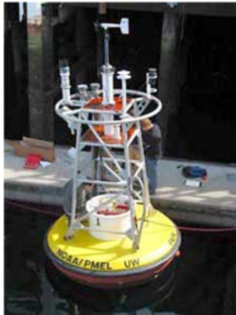
A buoy such as this one can carry equipment for directly measuring the pH of ocean water. NOAA

That's a question also asked about coral, which usually forms reefs in warm, shallow waters near